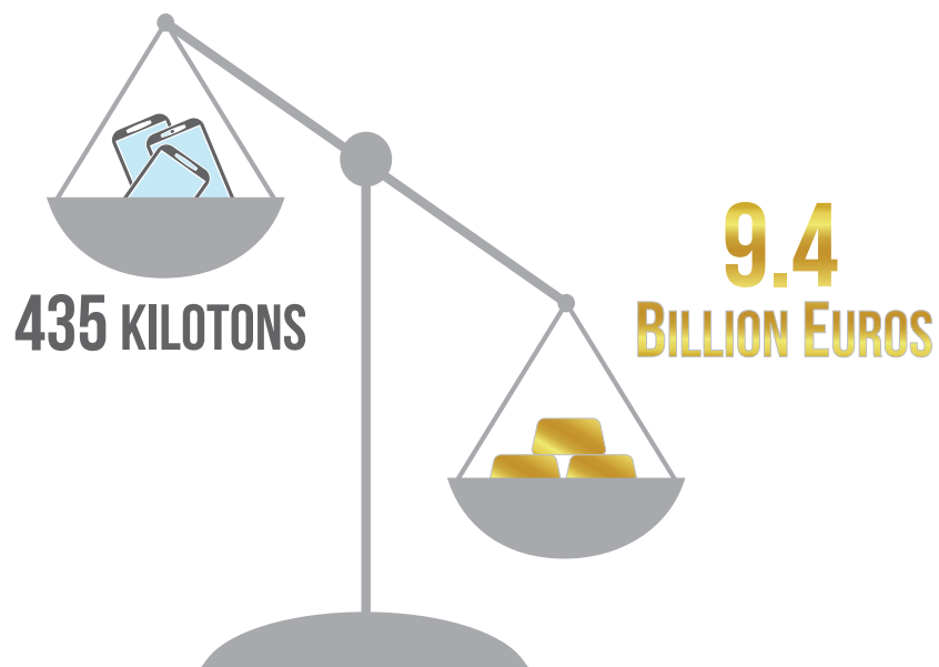
Illustration 9.2: Potential value of raw materials in mobile phone waste

al., 2017). If the recycling targets referred to the value of the materials, the whole recycling waste management cycle would be incentivised to recover valuable and precious materials incorporated in the discarded electric and electronic equipment. This would easily trigger a market mechanism that might facilitate improvements on the e-waste management worldwide.